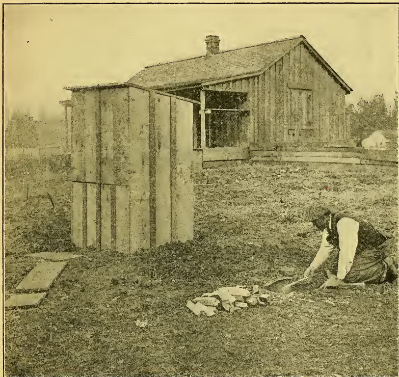
FIG. 2.—A smokehouse hastily constructed in the field. The operator is kindling a fire in the fire box, which, it should be noted, is several feet removed from the house but connected with it by an underground flue.

The house is 3 by 3½ feet inside measurements, 6½ feet high at the front and 6 feet high at the back, the roof having single pitch. If